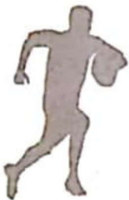
Lord Derby Cup