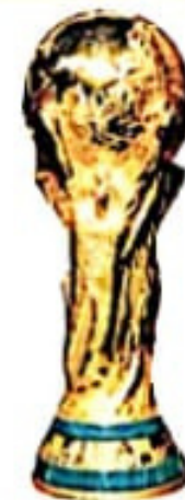
FIFA World Cup

To know more about cups and trophies associated with different sports, visit rsgr.in/is5gk-6 .