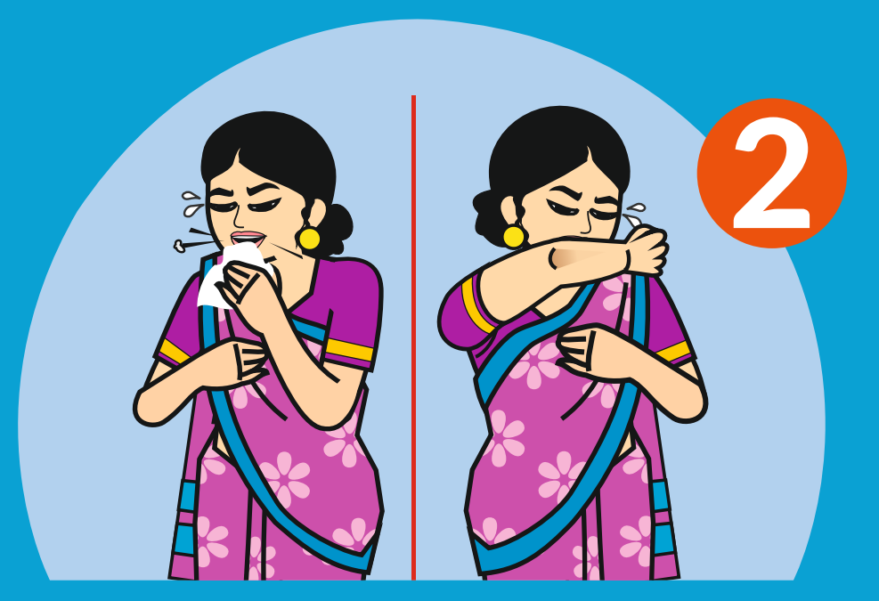
When coughing and sneezing, cover mouth and nose with handkerchief, tissue or elbow