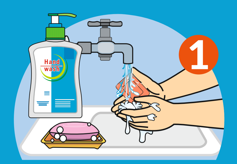
Wash hands with soap and water frequently